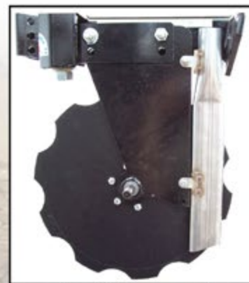
(Smooth disc removed)