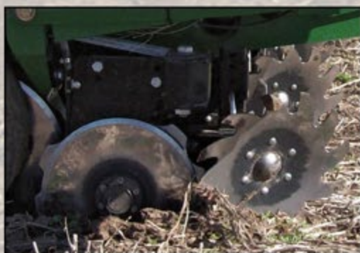
Shown with Pin Adjust Saber Tooth Row Cleaners

*The Sunco NutriFloater combines the Nutri Mate 3™ with Floating Saber Tooth Row Cleaners and is compatible with the Precision Planting CleanSweep System.