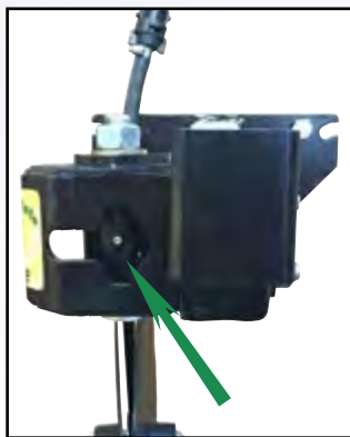
NutriMate 3's now feature greaseable pivot arms.