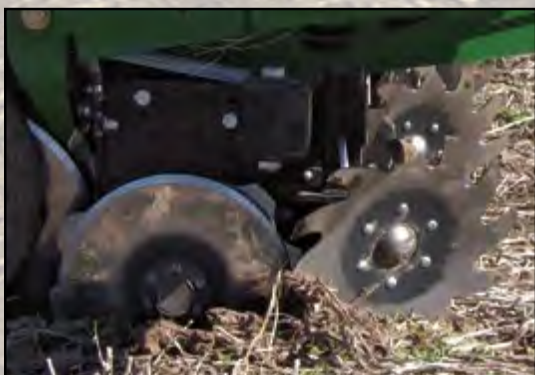
Shown with Pin Adjust Saber Tooth Row Cleaners

Nutri Mate 3™ will not only supply plants with starter fertilizer for immediate and vigorous emergence, but adequate amounts of nutrient can be applied to sustain plants during their yield producing growth.