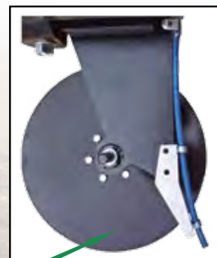
(notched disc removed)