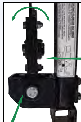
Exclusive maintenance-free 10° pivot allows Nutri Mate 3™ to flex independently of planter row unit.