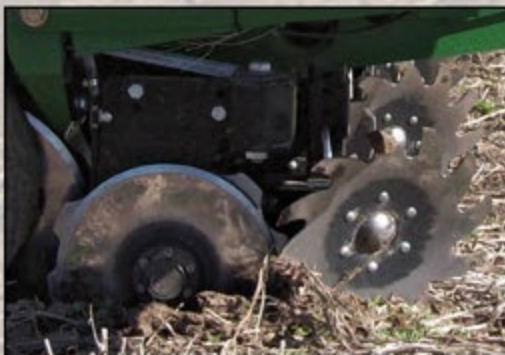
Shown with Pin Adjust Saber Tooth Row Cleaners

*The Sunco NutriFloater combines the NutriMate 3™ with Floating Saber Tooth Row Cleaners and is compatible with the Precision Planting CleanSweep System.