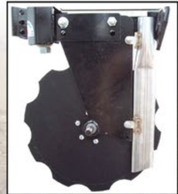
(Smooth disc removed)