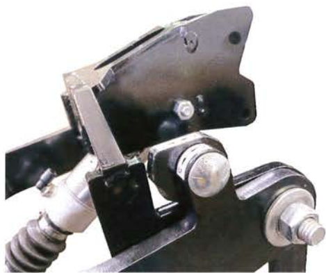
Sunco Floating Saber Tooth Row Cleaners feature an easily adjustable 9 sided cam for consistent row cleaner depth adjustment