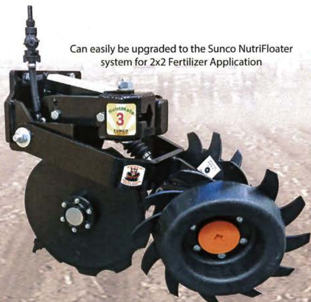
Can easily be upgraded to the Sunco NutriFloater system for 2x2 Fertilizer Application